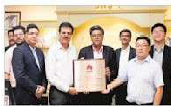
Representatives in DANST and Human Internationalists Company sign a men understanding in Inlandhae we are since